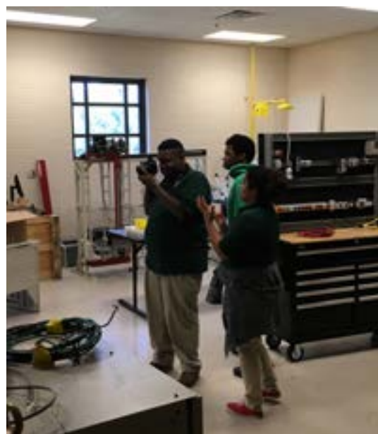
GSD students involved in Animation and Digital Media class at the Floyd County College and Career Academy

If you or someone you know would be interested in sponsoring our athletic programs or our school yearbook please contact us at- 706-777-2200.